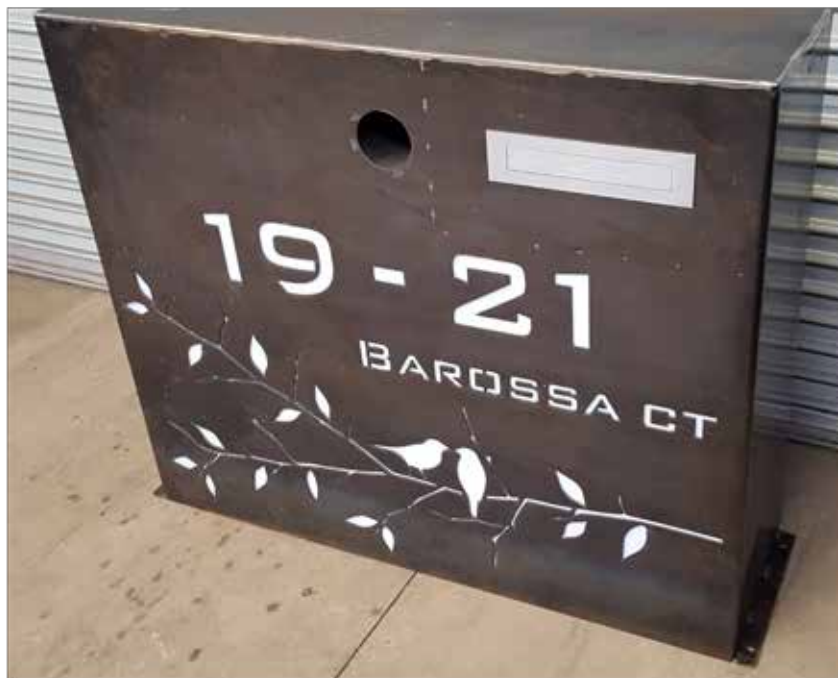
Flanges ( to bolt to existing concrete )