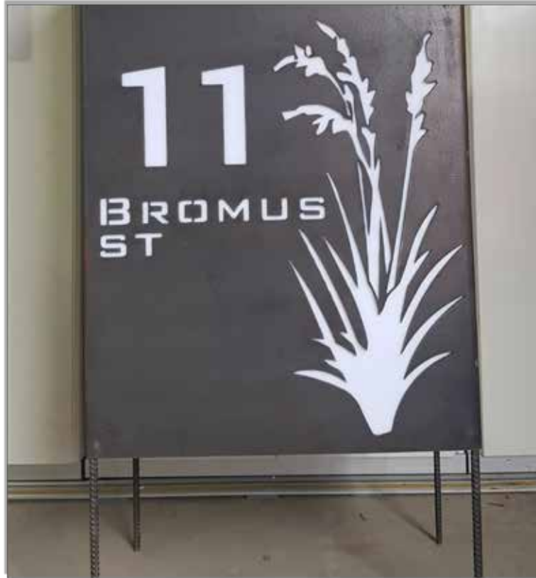
Reo legs ( to concrete into place )